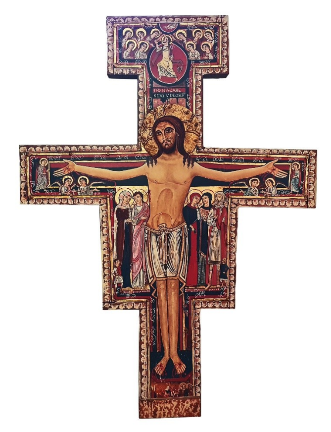
Figure 2. San Damiano Cross.

The figure on the cross has the wounds of crucifixion, so this is a suffering figure, but not a corpse, since the eyes are open and looking straight out at the viewer. Jesus is standing, rather than hanging—there is confidence, not defeat in the pose. The cross is, paradoxically, a triumph.