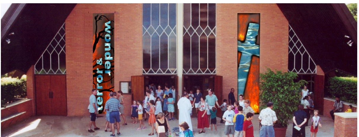
Figure 1. Lenten installation at Mt Carmel Catholic Parish, Brisbane. Artwork and photograph: Jenny Close.

Let me provide some background to my struggle with this question. Since my fields are primarily art and liturgy, I generally use liturgical images as a starting point for theological reflections. See in Figure 1, for example, the installation that I made a few ago for a Lenten season.