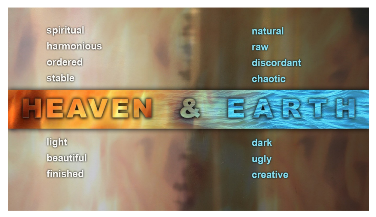
Figure 2: Illustration "Heaven & Earth" by Jenny Close When you look at it like this, heavenly ideals have the potential to inspire faint hearts with hope, and foster contemplation, while earthly realities have the potential to confront injustice, challenge the status quo and foster discipleship. Heavenly ideals are comforting while earthly realities are challenging.

On the heavenly end of the continuum, all is spiritual, harmonious, ordered, stable, light, beautiful and ultimately finished. On the earthly end, all is natural, raw, discordant, chaotic, dark, ugly and ultimately creative.